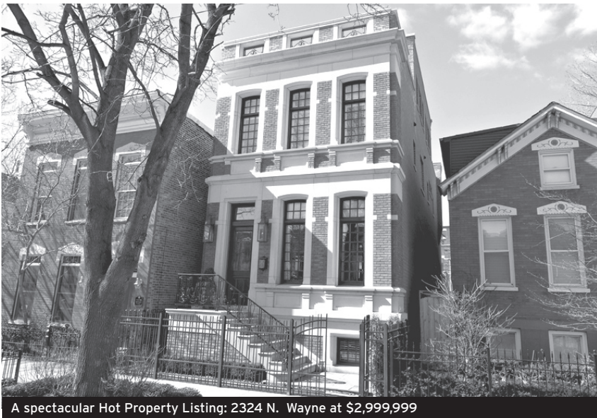
A spectacular Hot Property Listing: 2324 N. Wayne at $2,999,999