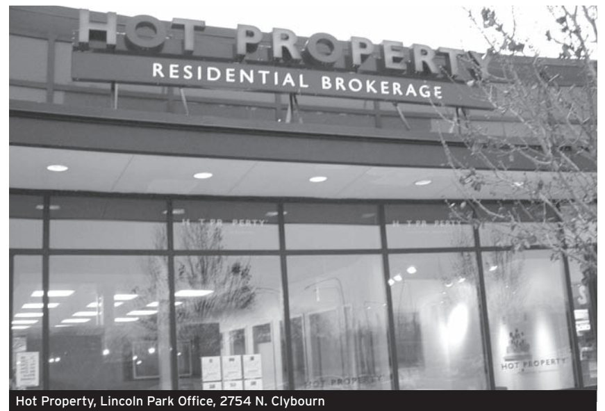
Hot Property, Lincoln Park Office, 2754 N. Clybourn